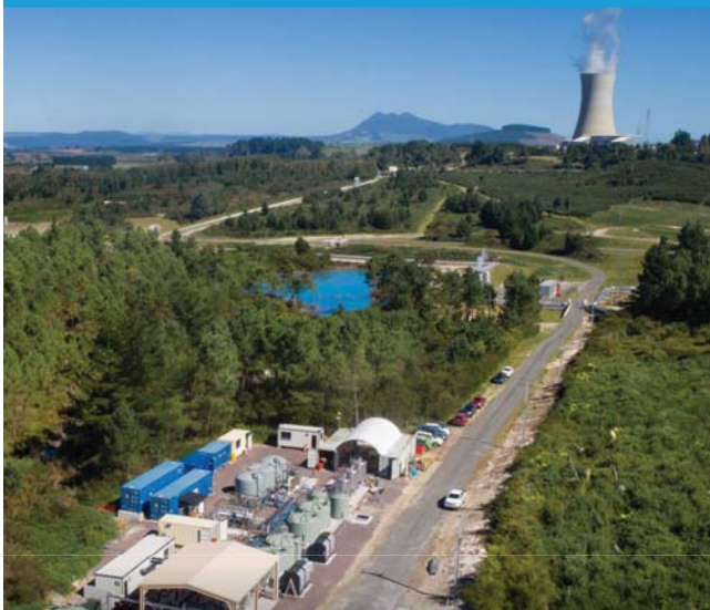
Geo40's first Silica Extraction Plant at Ohaaki Power Station in New Zealand

Geo40's naturally derived colloidal silica is high in purity and quality and can be used interchangeably with industrially produced equivalents.